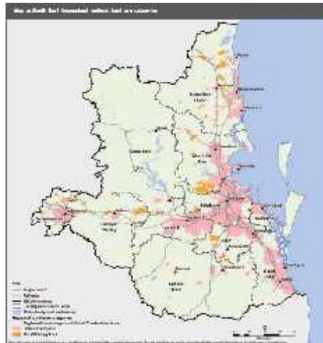
Figure 3: Map of SEQ regional land-use (Queensland Government, 2005)

The plan does acknowledge, albeit briefly, growth and development dependency between the SEQ region and the Tweed shire and calls for: [i] potential cross-regional development issues to be considered in a broader planning context; and [ii] arrangements to be put in place to address these issues. Furthermore, in explaining the regional significance of the Gold Coast, the plan highlights that “the Gold Coast’s urban development is concentrated between Yatala and Coolangatta, and continues south beyond the Queensland border into the Tweed Shire ’ (p.19, italics for emphasis). However despite this tentative recognition of cross-border urban growth and development, the ambitions/limitations of the plan remain clear: