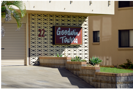
Fig. 3. Goodwin Towers, Burleigh Heads. Photograph by Andrew Leach, 2014.

the fibro shack (figs. 3 and 4). Burleigh Heads becomes, then, one of the enclaves against which the city entire can check the bases of its nostalgia, choosing, as it might, to project what it finds there back upon those parts of the city that once shared the character of the southern Gold Coast, but left it behind in the face of development (fig. 5). In Breezeblock Longboard , therefore, we can locate an instance of material and artistic appropriation in the name of identity in which the commonplace is rendered specific and instrumental – if not by the artist, then certainly by its owner and an unwitting public.