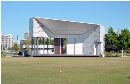
Fig. 5. Pavilion, Broadwater Parklands, Southport, by WhiteArchitecture, completed 2010.