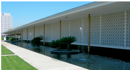
Fig. 1. Stuart Pharmaceutical Co., Pasadena, Calif., by Edward Durrell Stone, 1956.

In the trade of Portland cement for slag and cinder, function for decoration and abandonment of truth to materials, the concrete block - decorated in imitation of other materials or in patterned profile - lost any hope of widespread acceptance among a generation of architects who held a strict idea of modernism and its effects close in mind. Ada Louise Huxtable regarded the early incarnations of these blocks as indicative of the "tastelessness of the middle class" and Frank