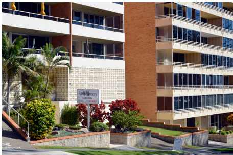
Fig. 4. Park Towers (foreground), Burleigh Heads.