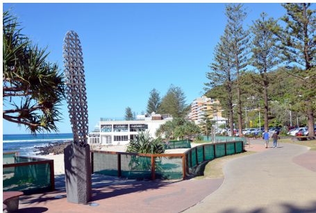
Fig. 2. Breezeblock Longboard , by Mike Taylor, 2007.

suburbs, which remain largely inert in the city's imagination of itself - as, indeed, they are inert in the maintenance of the heritage identity of all Australian cities. The breeze block may have gained a certain caché in recent years, but they are back just as they left us. 17 As the raison d'être of the metre maid was lost with the introduction of paper ticketing, the image invoked by the fibro shack speaks to an image lodged firmly in the past. Its materiality cannot actively mediate the relationship between history and heritage, the past and its image, as can the breeze block, which therefore functions historiologically as a fragment, with all that this implies.